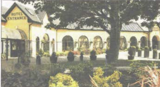
The hotel is in a prime location within the town of Westport