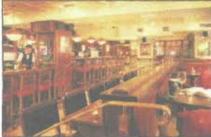
Petie Joe's Bar