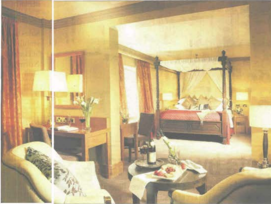
The Castlecourt Hotel, in

Headline: Atop-notch weekend getaway in County Mayo