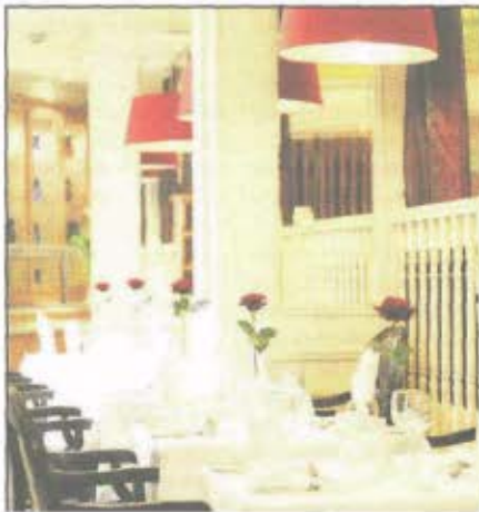
The Orchard restaurant